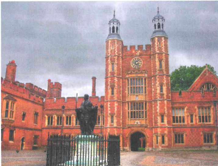
Members of the bourgeoisie can buy their children a privileged education. In this way, the family recreates social class inequalities over time.