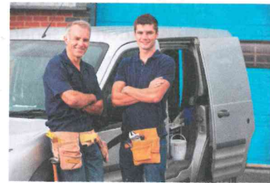
Parsons argued that men take the instrumental role as family breadwinners. Remember that he adopts a functionalist perspective.