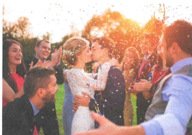
Critics argue that Marxists overlook people's satisfaction with marriage and family life.