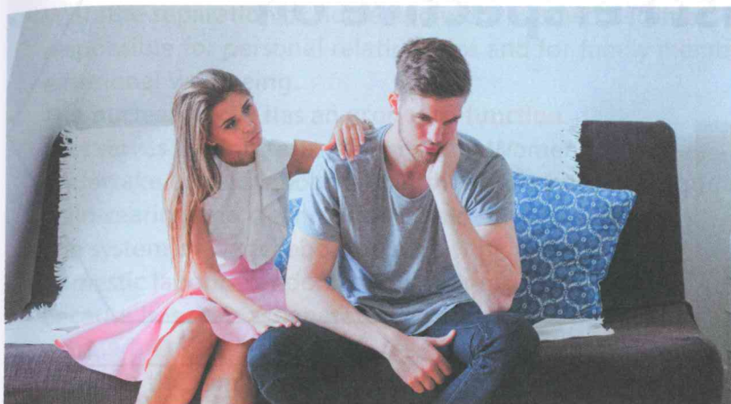
Emotional support from a spouse may help to relieve the pressures of everyday life.