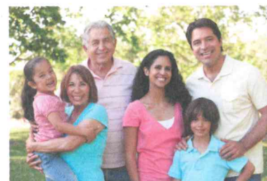
An extended family.