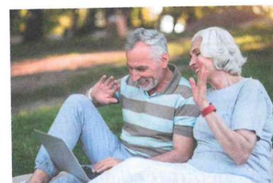
Geographical separation does not necessarily eliminate support between family members.