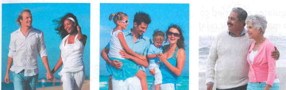
Life-course diversity – families at different stages in the family life-cycle.