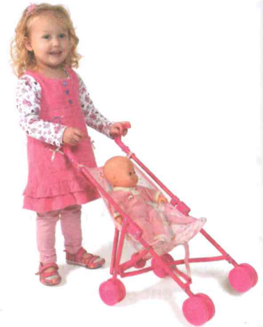
Gender socialisation in action.