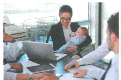
Women in dual-career families may experience role conflict.

The functionalist perspective sees the decline in conventional nuclear families as a problem for society.